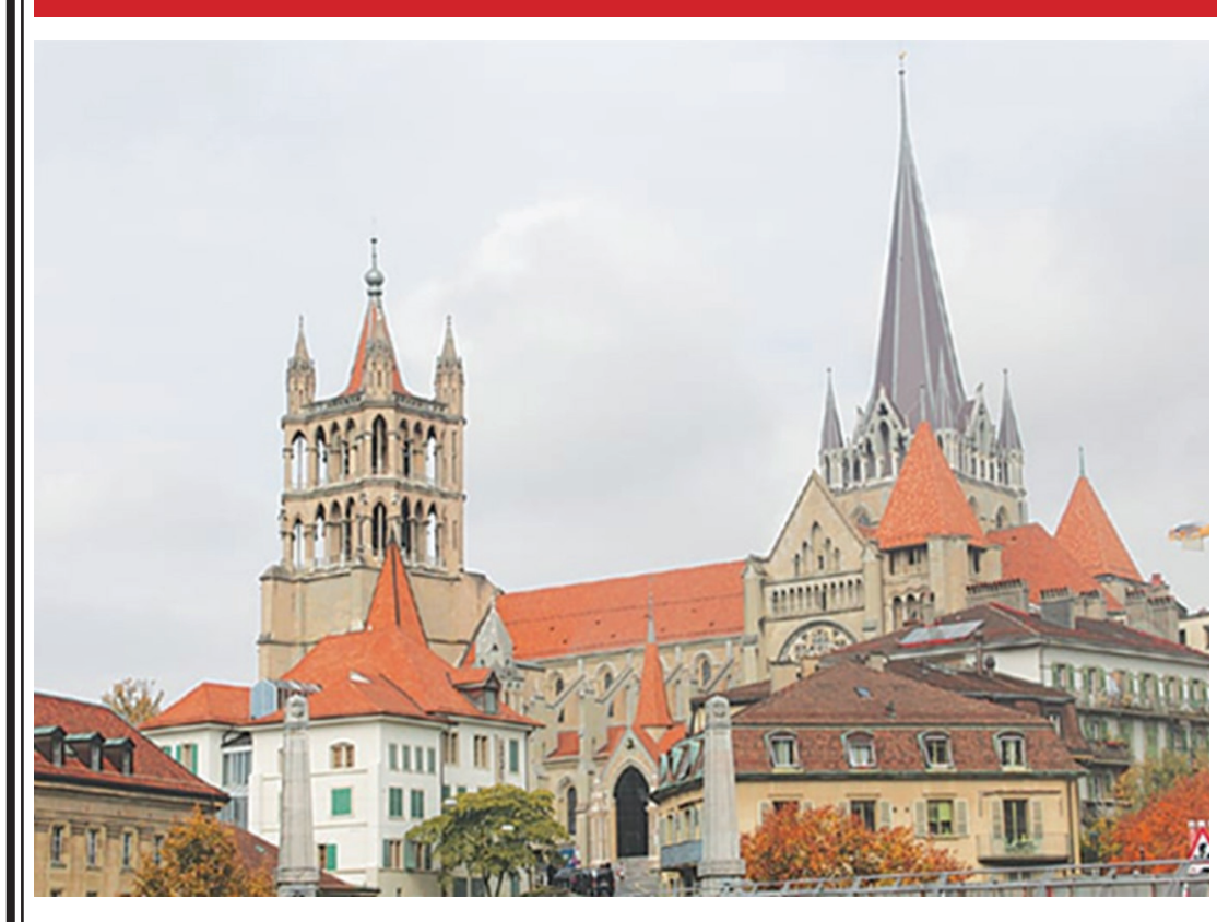
A FULL view of a cathedral from outside.

ists, the beautiful green pastures, rivers, lakes, the Alps and ski resorts of Switzerland and other buildings equally offer the serenity of richly preserved the Mediaeval and Middle Ages architecture to those interested in 12th-13th century building located art, built heritage, sacred material and visual culture. The art and architecture in Switzerland underwent many changes during the end of the 12th century. During Reformation and Protestant period in the 16th century which has been a central place of worship are reflected in the sacred art and